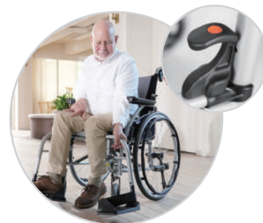
Detachable Swing-Away Footrests