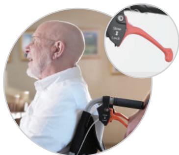
Push & Pull Brake System

Designed with both users and caregivers in mind, all movable parts are highlighted in high-visibility orange for easy identification and operation.