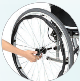
Quick Release Wheels Only for Ergo Lite 2