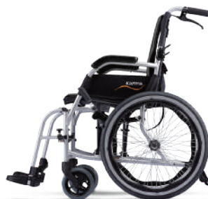
Ergo Lite 2