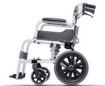
16" transport rear wheel option

Offers ample support for transfers and repositioning.