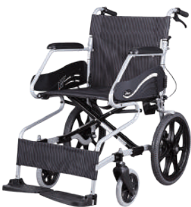
16" transport rear wheel option

Allow the wheelchair user to move closer to desks and tables.